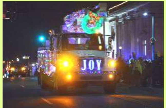
Danville Christmas Parade Dec. 7, 7pm Check their FB page, Heart of Danville, for a scrolling list of activities!