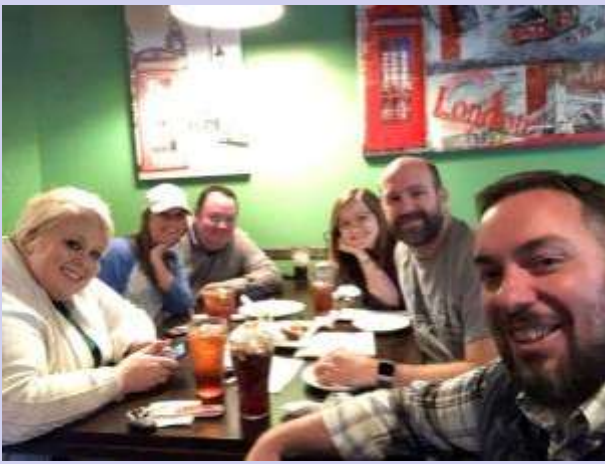
The London Downtown Main Street Shop Small team had to stop and refuel at the Abbey!