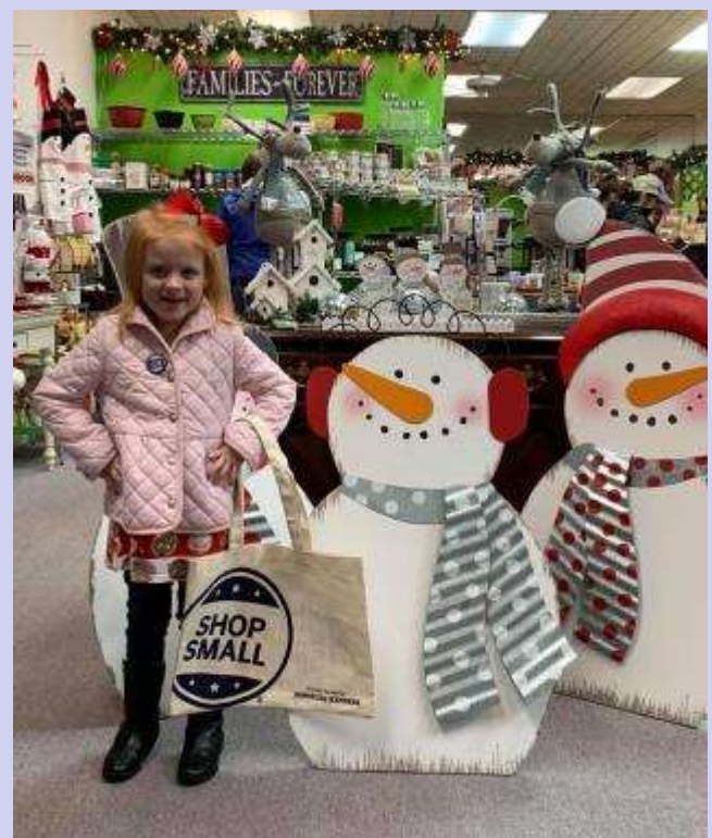
Starting smalls out on the right track! Teaching them to Shop Small in Pikeville!