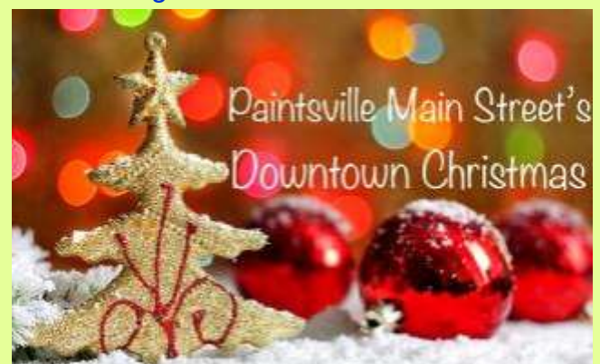
December 7th 1:00-5:00

Downtown Cynthiana, Around the Courthouse on Main Street Schedule of Events: