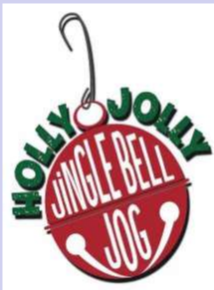
· Hosted by City of Cadiz Main Street Program Saturday, December 14, 2019 at 9 AM