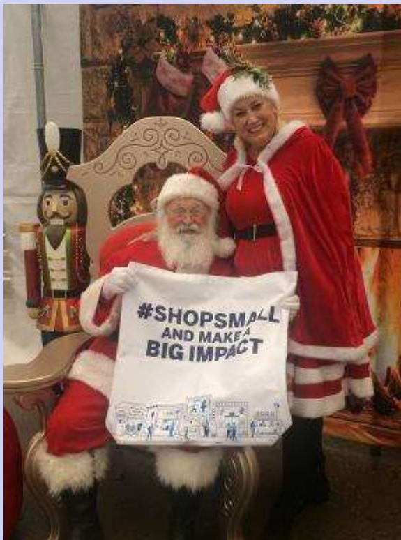
Santa and Mrs. Claus know that shopping small and shopping local make a BIG impact! 67cents of every dollar stays in your community!